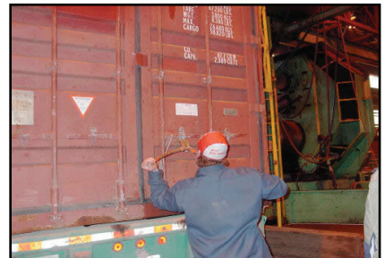
SHIPPING & DELIVERY